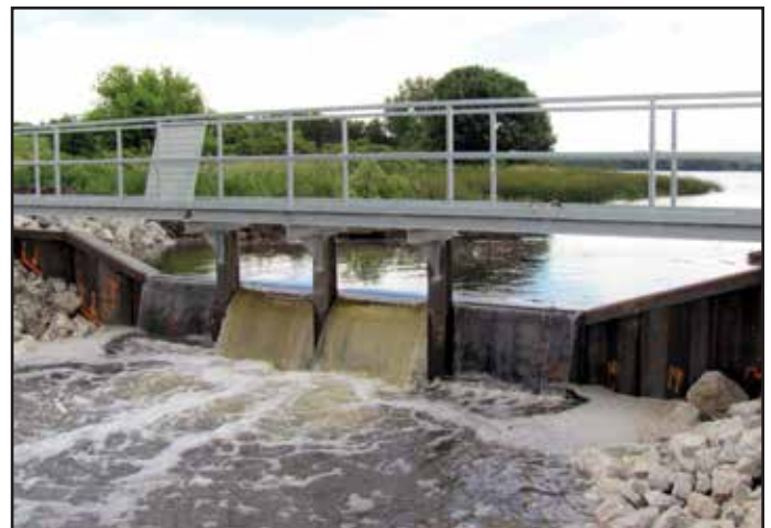
Releasing water for the first time through the new water control structure.