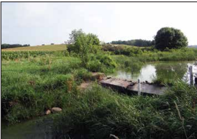
Old deteriorated State Line Lake concrete dam structure, since removed.