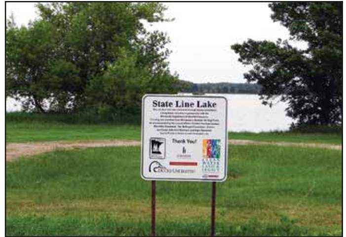
Project sign recognizing partners who contributed toward the State Line Lake Enhancement Project.