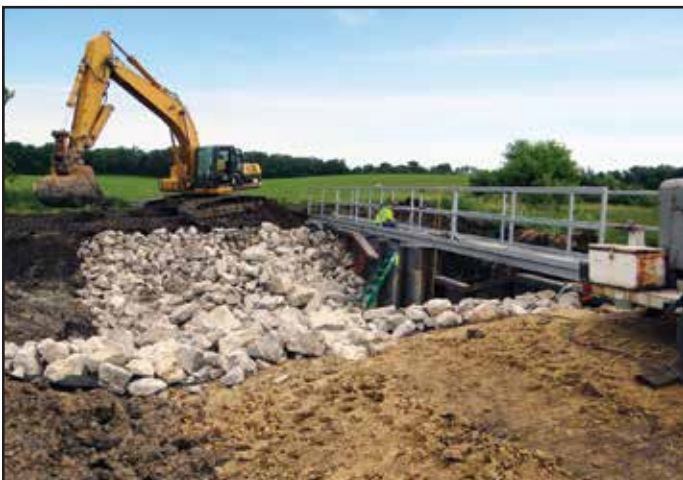
Contractors installing the new variable crest water control structure on the outlet of State Line Lake.