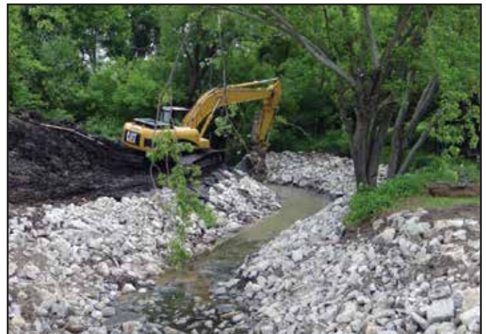
Contractors working on channel stabilization work downstream of the high velocity fish barrier.